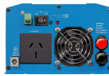
Phoenix Inverter 12/800 with AN/NZS 3112 socket