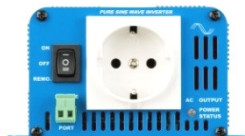
Phoenix Inverter 12/180 with Schuko socket