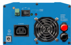
Phoenix Inverter 12/800 with IEC-320 socket