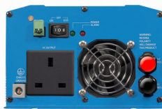
Phoenix Inverter 12/800 with BS 1363 socket