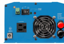
Phoenix Inverter 12/800 with Nema 5-15R socket