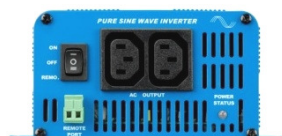
Phoenix Inverter 12/350 with IEC-320 sockets