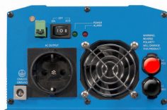
Phoenix Inverter 12/800 with Schuko socket