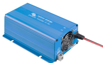
Phoenix Inverter 12/180