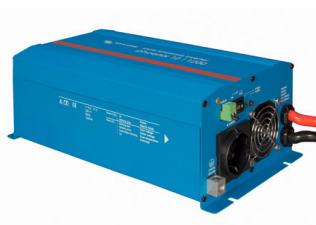
Phoenix Inverter 12/800 with Schuko socket